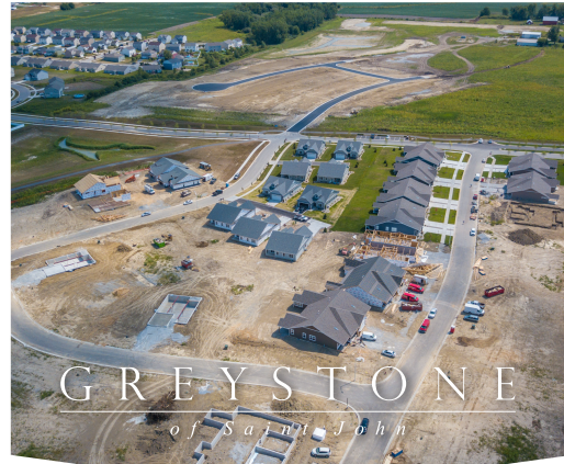
GREYSTONE of Saint John