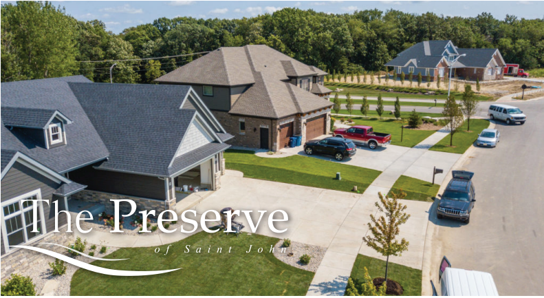
The Preserve of Saint John