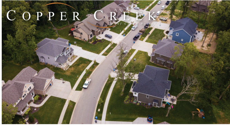
COPPER CREEK of Crown Point