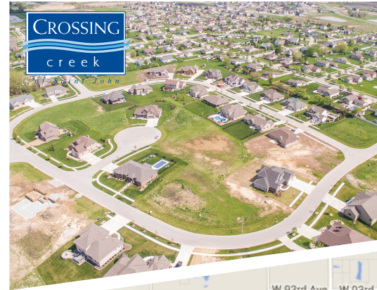
CROSSING creek of Saint John